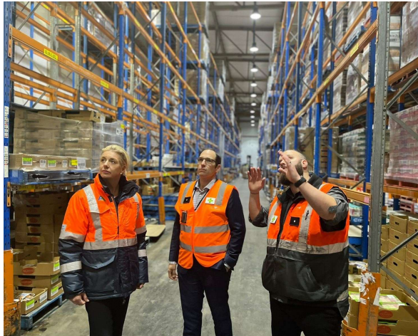
Senator Bridget McKenzie and QLD Nationals Senator Matt Canavan