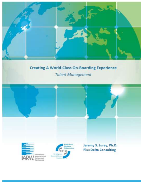
Creating a World-Class On-Boarding Experience